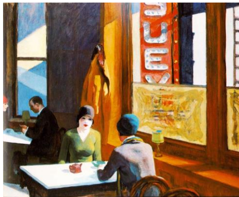
Chop Suey – Edward Hopper, 1929