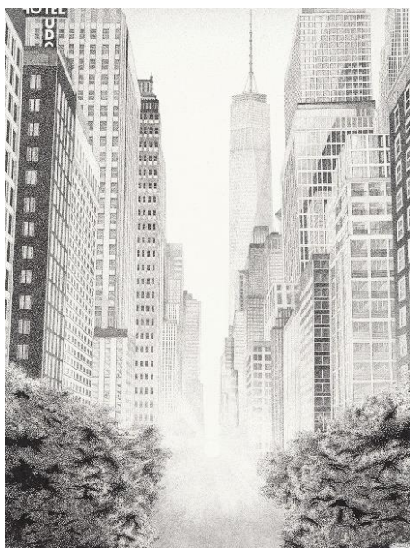
Skip Sturtz - Manhattanhenge - Pen & ink

Echoing Between . . . The non-objective abstraction reveals and conceals layers of marks, pulling us to the surface and then beneath it. It is both a visual and in some way an auditory reminder of the haunting temporality of life.