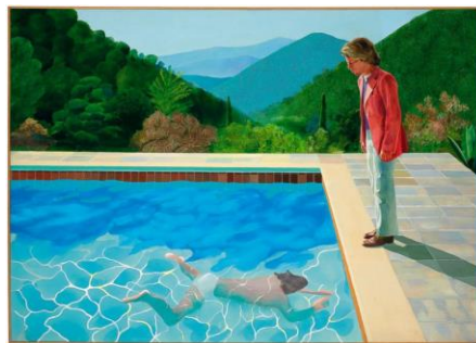
Portrait of an Artist (Pool with Two Figures) – David Hockney, 1972

Tuesday, May 21, 2019 - Potluck & show & tell