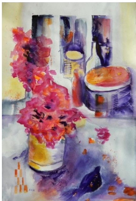
Ann Sisel - Poppies - Watercolor

Nightfall . . . the artist masterfully layers drawn, scratched and rubbed out marks with painterly brushwork in dominantly low key complimentary colors. The result feels alive with the complex rhythms of a city's pulse at dusk.