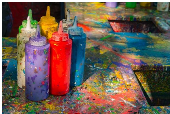
Peter Freeman - Spin Art Colors – Photography

Spin Art Colors . . . the artist caught the bottles in a pool of light reminiscent of a Dutch master still life. The table tops evoke an early Jackson Pollock. And then there is the eternal question of high/low art. Is spin art really art? In this case, absolutely.