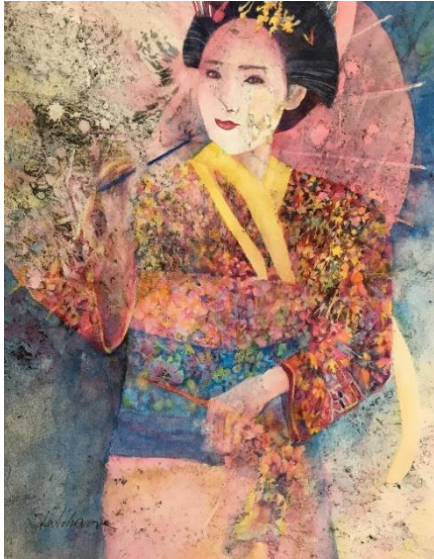
Sonja Hutchinson - Geisha - Watercolor & graphite

Geisha . . . The technique in this watercolor is really intriguing. There is ghost imagery in graphite or charcoal . . . The transparent watercolor layers hold some edges, let others go creating the distinct sensation that we are witnessing the present and the past in one observable moment.