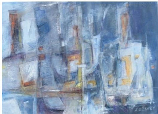
Jack O'Leary - Nightfall - Acrylic

Nightfall . . . the artist masterfully layers drawn, scratched and rubbed out marks with painterly brushwork in dominantly low key complimentary colors. The result feels alive with the complex rhythms of a city's pulse at dusk.