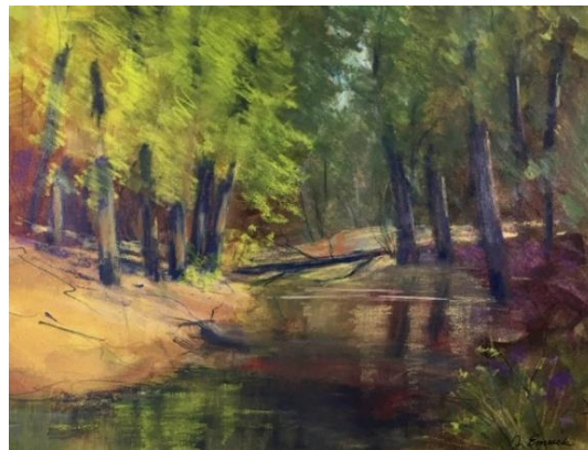
Jeanne Emrich - Autumn Creek - Oil Pastel

painting. The 'alla prima' impression of daily life, without being confined by the observation of, showcases the artist's bold technique.