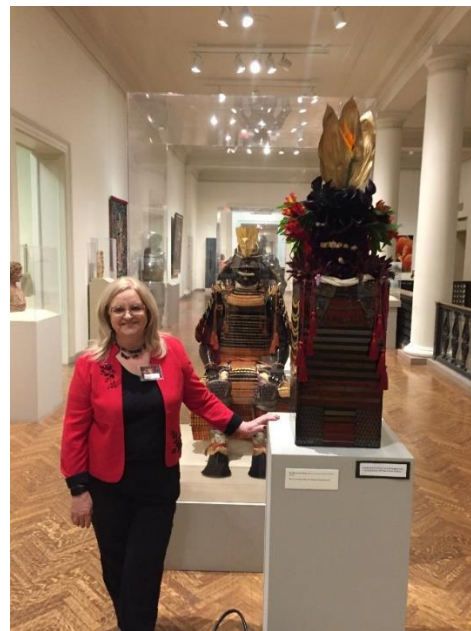
Armor and Helmet