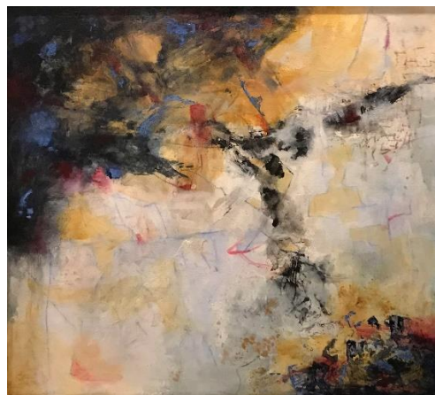
Kaye Freiberg - Echoing Between – Acrylic

breath-taking . . . through the use of a masterful gradation at the base of the buildings—the city appears to levitate.